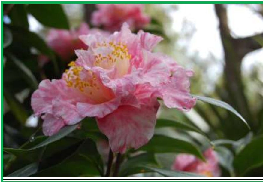
Camellia photo, courtesy of Jill Reed:

MONDAY, January 6- Farewell Breakfast in the Convention Center